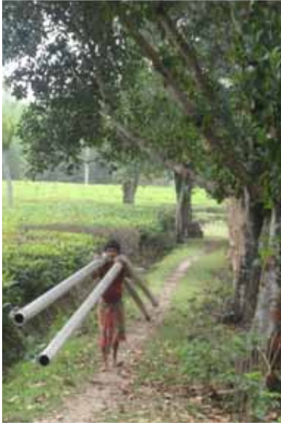
Figure 3: A tea grower transporting the irrigation pipes to the next tea field

higher profits. Many of the independent producers participate in SHGs that collect the tea, sell it, and distribute the profits to the farmers. Being part of the SHG means that farmers do not have to pay to transport their tea and they have the security of a guaranteed buyer. Others have chosen to be ‘out-growers’, where they sell their land to a tea company, continue producing tea on the same plot, and the company purchases all of the produce. Both purchased fertilizers and cow dung are used, and pesticides are heavily used.