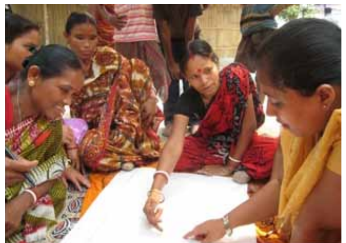
Figure 4: Women participating in a baseline assessment in the Jaldhaka watershed

If all farmers with suitable land took up independent tea production, those farmers would benefit from increased income. Opportunities for labor would increase, and membership in SHGs and farmers clubs would rise. Input shop owners, packaging and processing units, and the transport sector would also benefit. Because tea is a long-term crop, future generations would benefit. Further benefits would be realized if the government removed the income tax on tea and subsidized inputs such as sprinkler irrigation. Despite all of these benefits, the increased tea production would negatively impact food security in the whole area because there would be much less land available for food crop production. Because tea production requires heavy use of pesticides and fertilizers, there would be environmental degradation. Ultimately, insect populations would get out of balance, increasing pest problems for the whole agri-