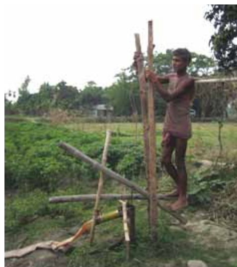
Figure 1: Farmer in the Jaldhaka watershed using a treadle pump

Agricultural water management (AWM) interventions are increasingly being promoted as a first step to enable positive development, alleviating food insecurity and poverty in the smallholder farming systems that dominate rural South Asia and sub-Saharan Africa. These AWMs range from in-situ soil and water management improvements (conservation tillage, terraces, pitting) to supplemental and full irrigation systems, drawing water from a wide variety of sources in the landscape. However, re-allocation of water can potentially undermine other uses of the same water, for other livelihood purposes or, indirectly, by reducing availability for support of different ecosystem services. This case study, in the Jaldhaka watershed in West Bengal, India, aimed to create a baseline of resource-based livelihoods and to assess the local hydrology. Scenarios were developed through consultations with local watershed experts to discuss potential impacts on the various livelihoods and water resources in Jaldhaka, of various AWM interventions.